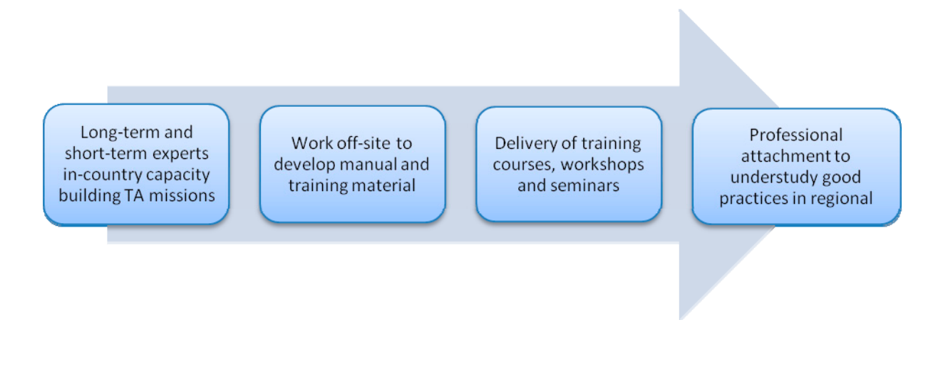
Figure III. Modalities for Delivery of Revenue Administration Sector TA in FY 2012