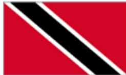
Trinidad and Tobago