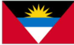
Antigua and Barbuda