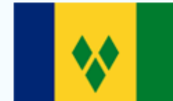
St. Vincent and the Grenadines