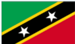
St. Kitts and Nevis